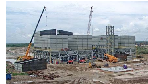
Steel Dynamics is one of the largest baghouse projects awarded to an EPC contractor in the last 5 years

2 baghouse systems, total air volume 3,300,000 acfm.